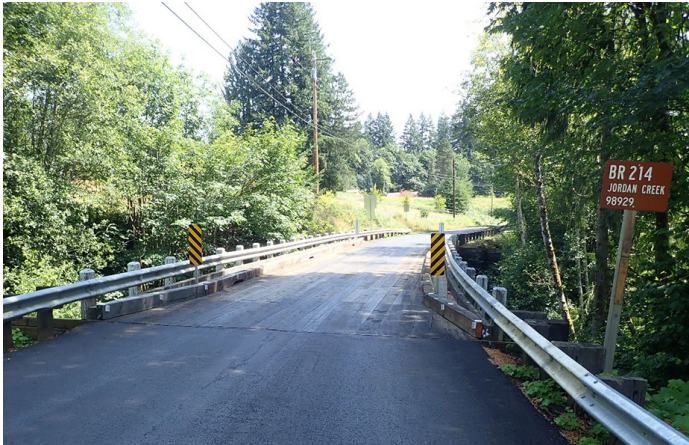
Jordan Creek Bridge on Jordan Rd, between Arlington and Granite Falls, is scheduled to be replaced in 2024.