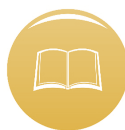
Play & Learn Websites