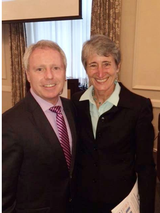
Sally Jewel, US Secretary of the Interior