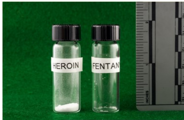
Fatal doses of heroin and Fentanyl

Opioid receptors can also be found in areas that control breathing rate. High doses of fentanyl, as well as other opioids or heroin, can cause breathing to stop completely. One of the symptoms of opioid/heroin overdose is that the victim is not breathing.