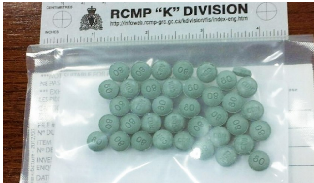
Fentanyl can be produced as pills that look like other

Carfentanil is a synthetic opioid, similar to fentanyl, but 100 times deadlier than fentanyl. Carfentanil has no medical use for humans. It is used as a sedative for large animal such as elephants. In fact, some